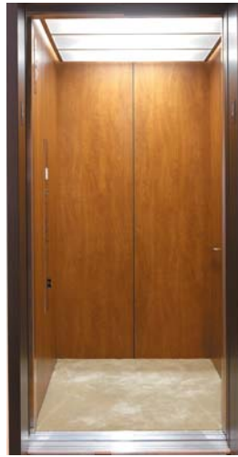
Shown: Standard cab with Wild Cherry plastic laminate finish.